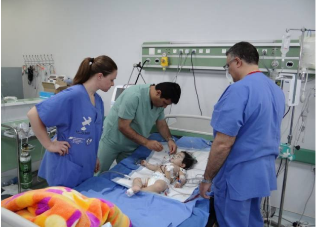
Open Heart Surgery Team