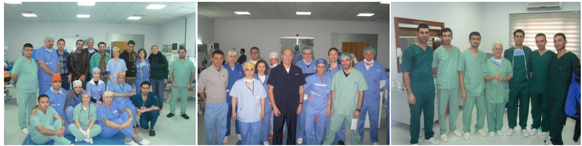
San Donato Hospital – Milan Cardiac Team

6-Italian Medical Delegation visits Duhok to Cure Congenital Heart Diseases children, from 12th Jan., till 19 Jan., 2013